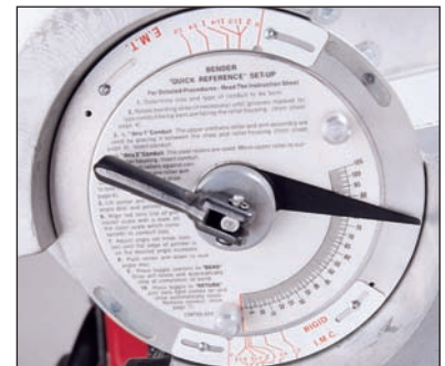
Easy dial settings-makes training time virtually non-existent.