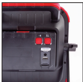
USB Accessory Charger