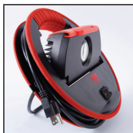
Directional LED Swivel

4 industrial grade magnets on the back allow for easy mounting when space is limited or the adjustable kickstand can be used on a table or floor.