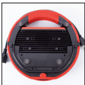
4 Heavy Duty Magnets