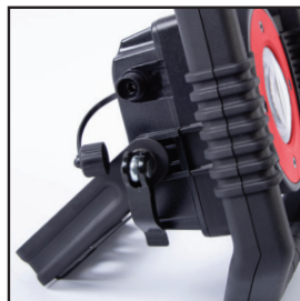
Water Resistant Charger Cover