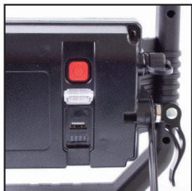
USB Accessory Charger