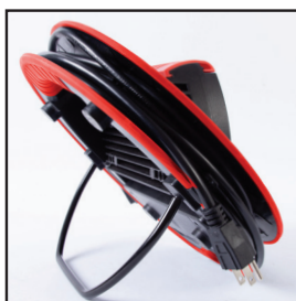
Built in Stand & Power Cord Caddy