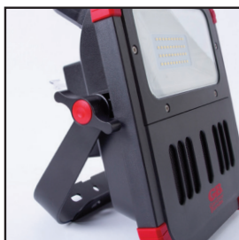
Quick release locking and rotating base