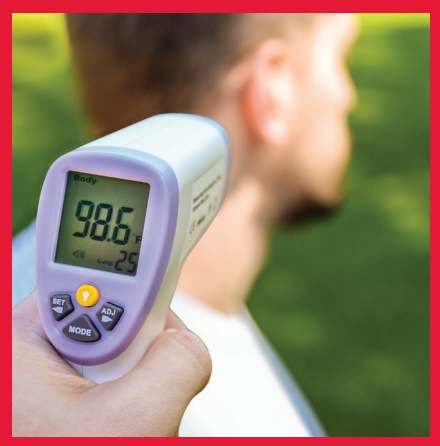
2. Behind the Ear