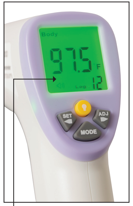
Back-lit screen displays the present temperature measurement